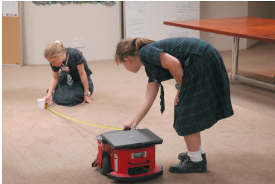
Figure 2: Picture of one team performing a translational error experiment.

Experiment 1: Simple movement. In this experiment, students were required to instruct the robot to move forward by four different distances: 500mm, 1000mm, 2000mm and 3000mm. For each of these distances, the students had to measure the exact distances the robot actually travelled and compared that to the presumed distance travelled. Result: The students found that there were minor errors for the smaller distances but became more inaccurate for larger distances.