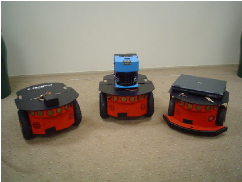
Figure 1: The three Pioneer robots used for the course. Each is equipped with eight sonar sensors, the one in the middle has an additional laser range finder.

As mentioned before, contests are a popular means of keeping students interested, which is why we decided to have a competition between the three groups at the end of the course. To encourage the students to become creative, we tried not to restrict what they could do but, at the same time, it is important to give them a task that is actually solvable within the tight time-frame. Our final choice is to have a robot dancing contest. The aim was to provide an opportunity to apply the knowledge on robotics that they gained during the course in a single application, and encourage them to become creative and have fun. Each group chose a song for the dance performance, and programmed the robot to move synchronously to the music, being allowed to move only within a pre-defined region of the dance floor. The competition was held at the school, which organised an open day and invited the parents and classmates to attend the function. The judges for the competition were the dean of our faculty and the school's principal.